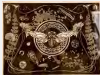
Metamorphosis Linoleum Relief Print, 2021 Mia Vinson

UL acquired four new pieces of student work as part of the Libraries' permanent collections, placed in the main Bizzell stairwell.