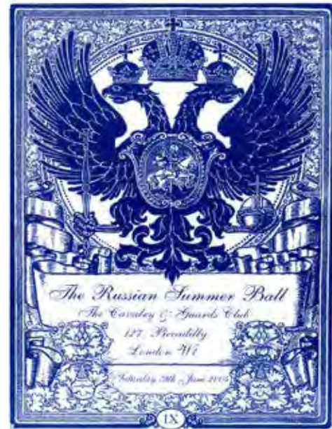
An invitation to the 2004 Russian Summer Ball in London, part of the items in the Romanoff Collection.

The Romanoff Collection at University Libraries opened to public research in January 2023, after a generous $2 million gift to the University of Oklahoma in late summer 2022.