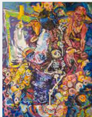
Fritz Fits the Demo & the Model Sits Politely: A Blindfolded Lesson On Looking Acrylic on Canvas Cody Wilson

This is a painting that depicts the action of time. The artist's attention is always drawn to the movement of time when it comes to the mundane parts of life, as sometimes they mark the passage of time better than hours and days and seconds.